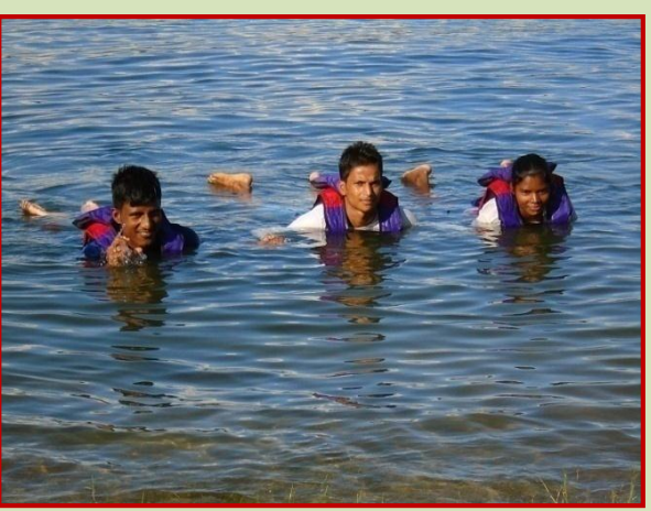
NSS Volunteer took part in adventure camp