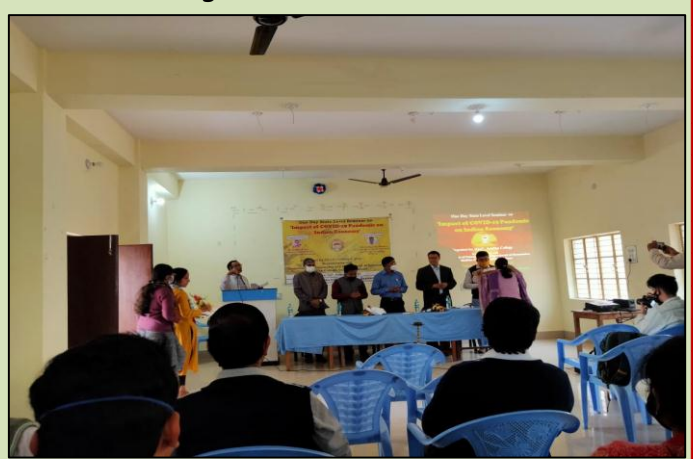
State Level Seminar