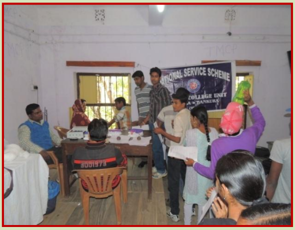
Thalassemia Test Camp