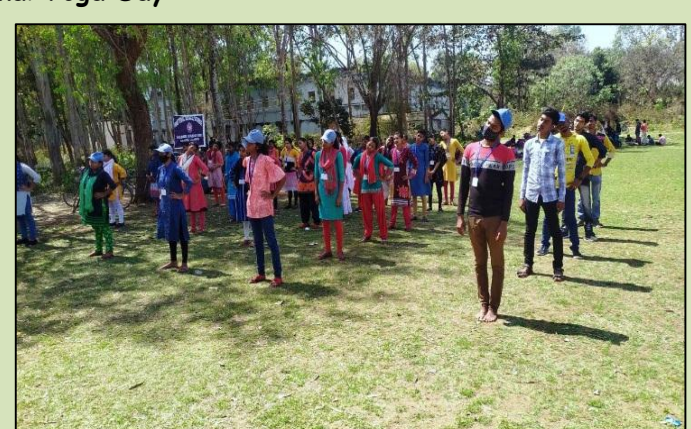
Women's Self Defense Training