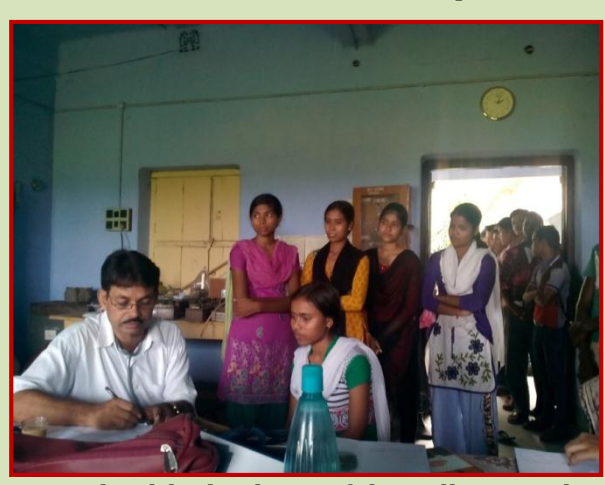
During health check-up of the college students