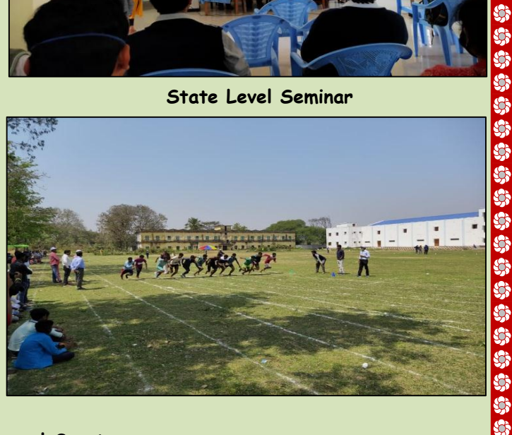
College Annual Sport