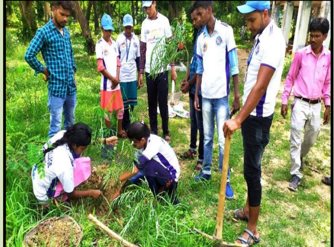
World Environment Day